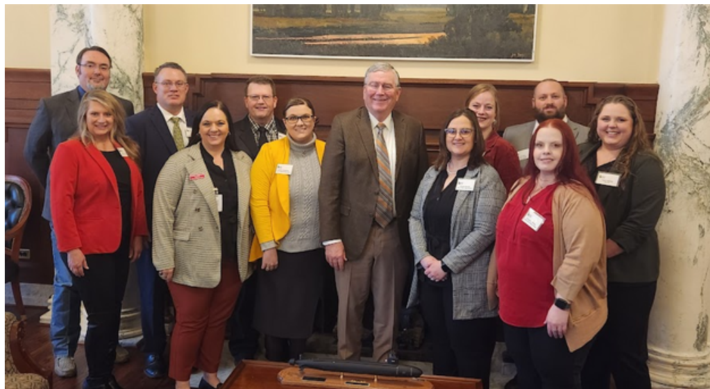
2023 STATE POLICY SEMINAR PARTICIPANTS WITH LIEUTENANT GOVERNOR BEDKE

Follow QR code or click HERE to register now.